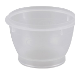
Pall, 100 ml / 250 ml Sentino® disposable plastic funnel (4870 / 4871)