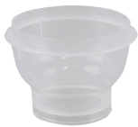
Sartorius, 100 ml / 250 ml Microsart® disposable plastic funnel (16A07-10-----N/ 16A07-25-----N)

Step 2. Choose the disposable funnel and adaptor