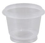
Millipore, 100 ml / 250 ml Microfl® disposable plastic funnel (MIHAWG100 / MIHAWG250)