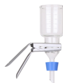
Rocker, 300 ml VF 6, Glass Filter Holder (167120-31)