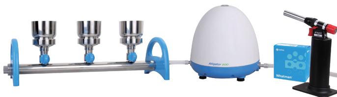
Filtration System Assembly Diagram