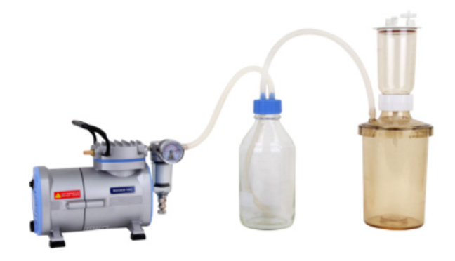
Using a safety bottle to prevent from overflowing