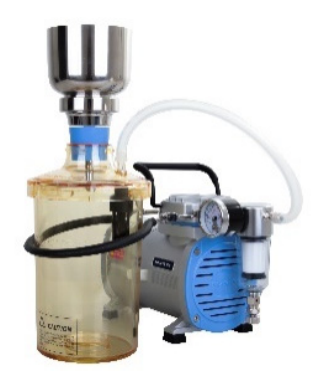
Rocker 300 - SF 30