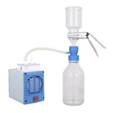
Chemker 300 - VF 12