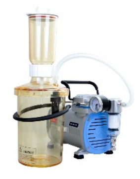
Rocker 300 - LF 30