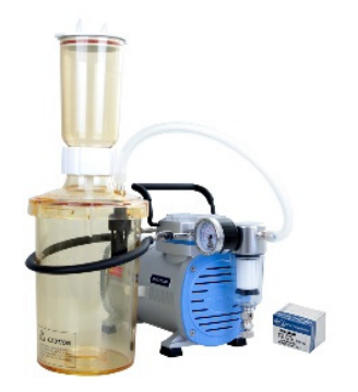
Rocker 300 - LF 30 - SS