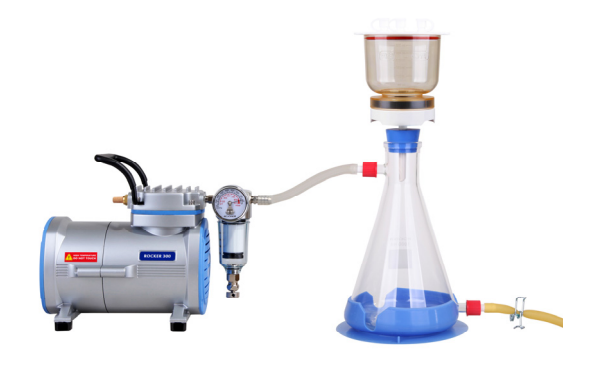
Rocker 300 - LF 31