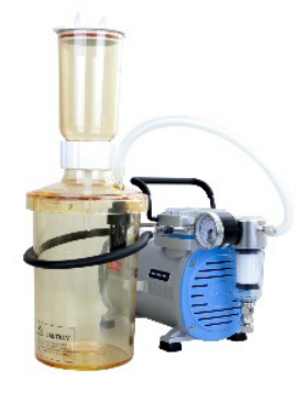
Filtration System Assembly Diagram

Please ensure the liquid level in moisture trap and flask does not exceed safety limit. Failure to comply may cause serious damage to the pump and void the warranty. If this occurs, please contact your distributor immediately for service.